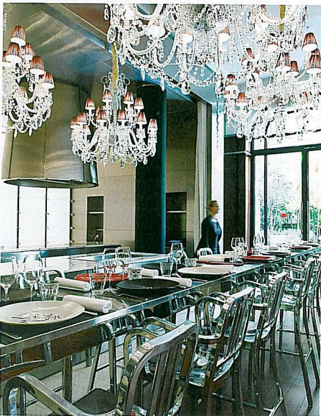
CLOCKWISE FROM BOTTOM LEFT: ; OPPOSITE. CLOCKWISE FROM TOP LEFT